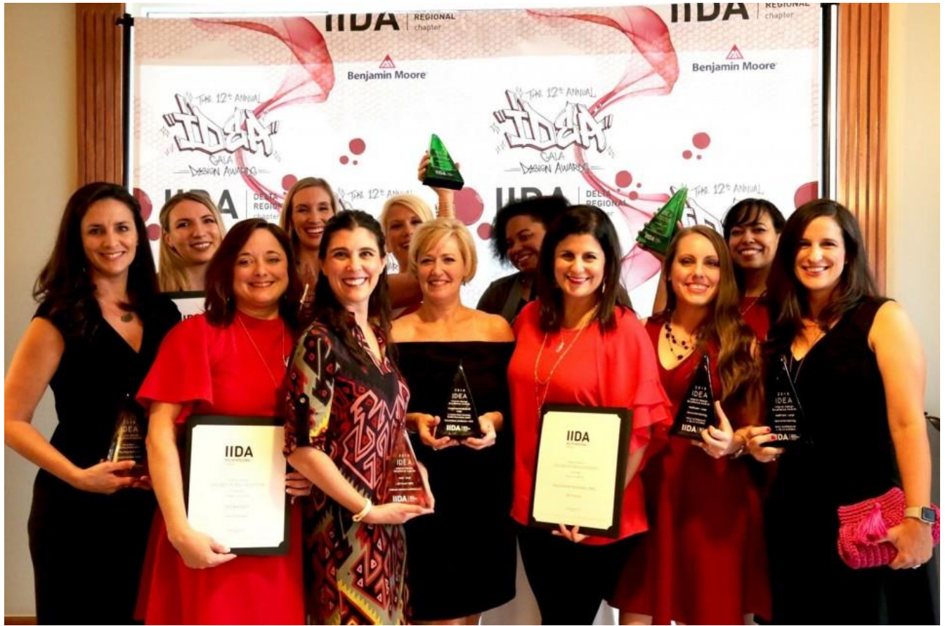
2018 Award Recipient Group Photo, August 25, 2018 The Riverview Room, New Orleans, LA